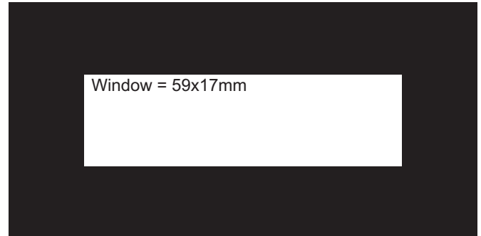
BEZ-120 Overall = 87x44mm