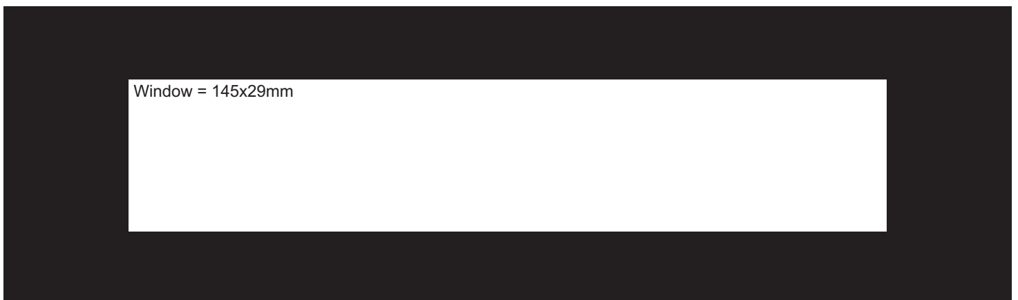
BEZ-440 Overall = 193x57mm

Hardware varies by model 0.5mm (0.020") thickness Water-clear polycarbonate Permanent acrylic adhesive backing